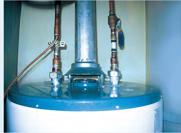
FIGURE 1: Prior to approximately 2000, residential water heaters were predominately connected using solid copper pipes, cut to length and permanently soldered into place.

Independent testing has revealed that the catastrophic failure of flexible supply lines may not simply be attributable to a